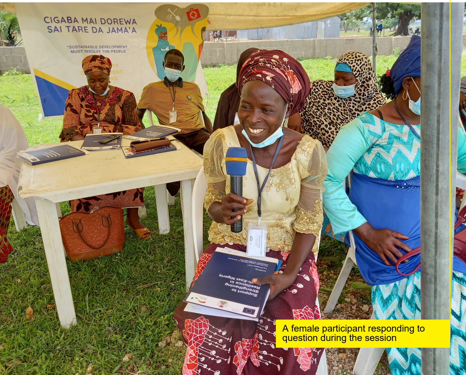
A female participant responding to question during the session