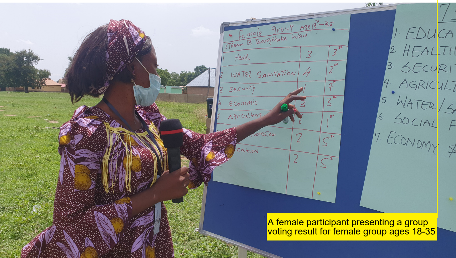
A female participant presenting a group voting result for female group ages 18-35

personnel and weapons due to the level of insecurity. These problems and challenges were clustered along with seven sectors.