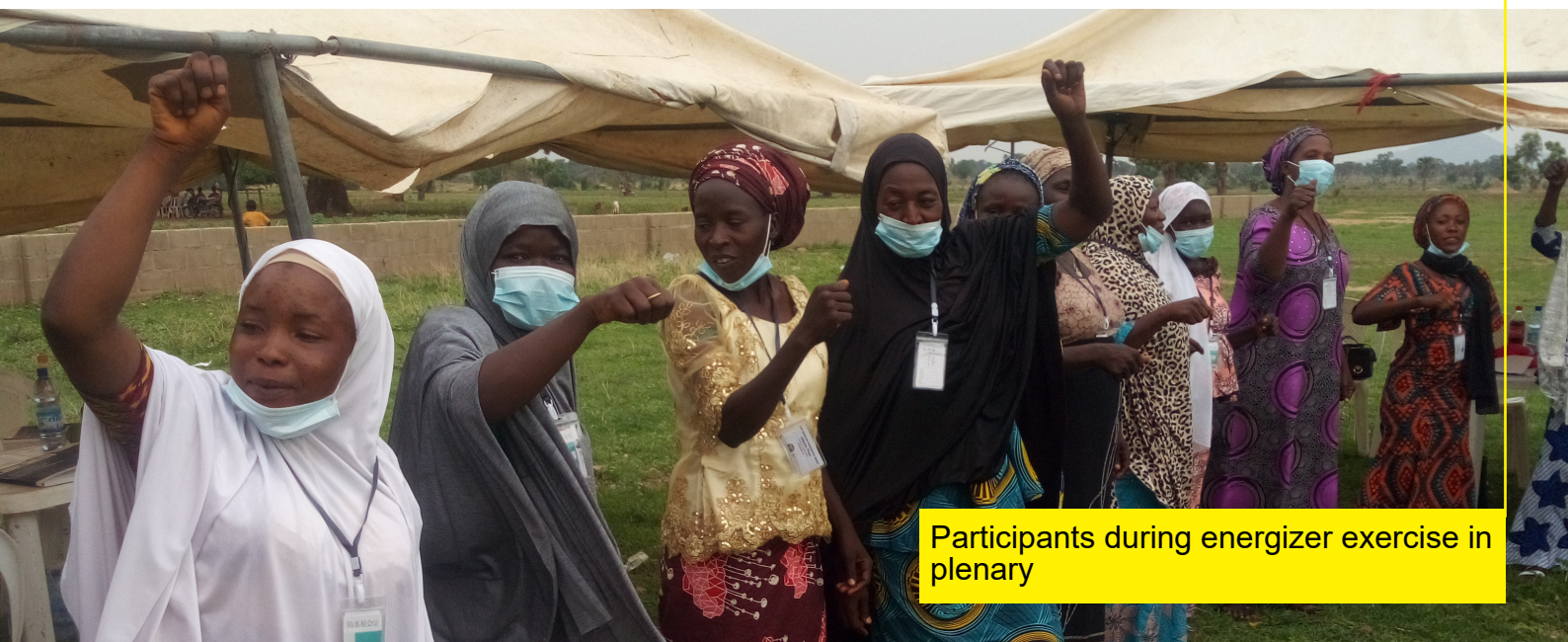
Participants during energizer exercise in plenary