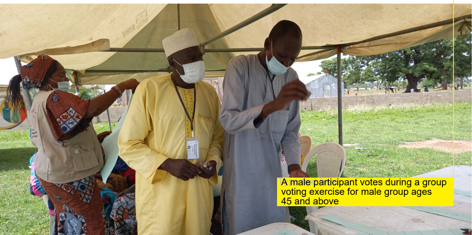
A male participant votes during a group voting exercise for male group ages 45 and above