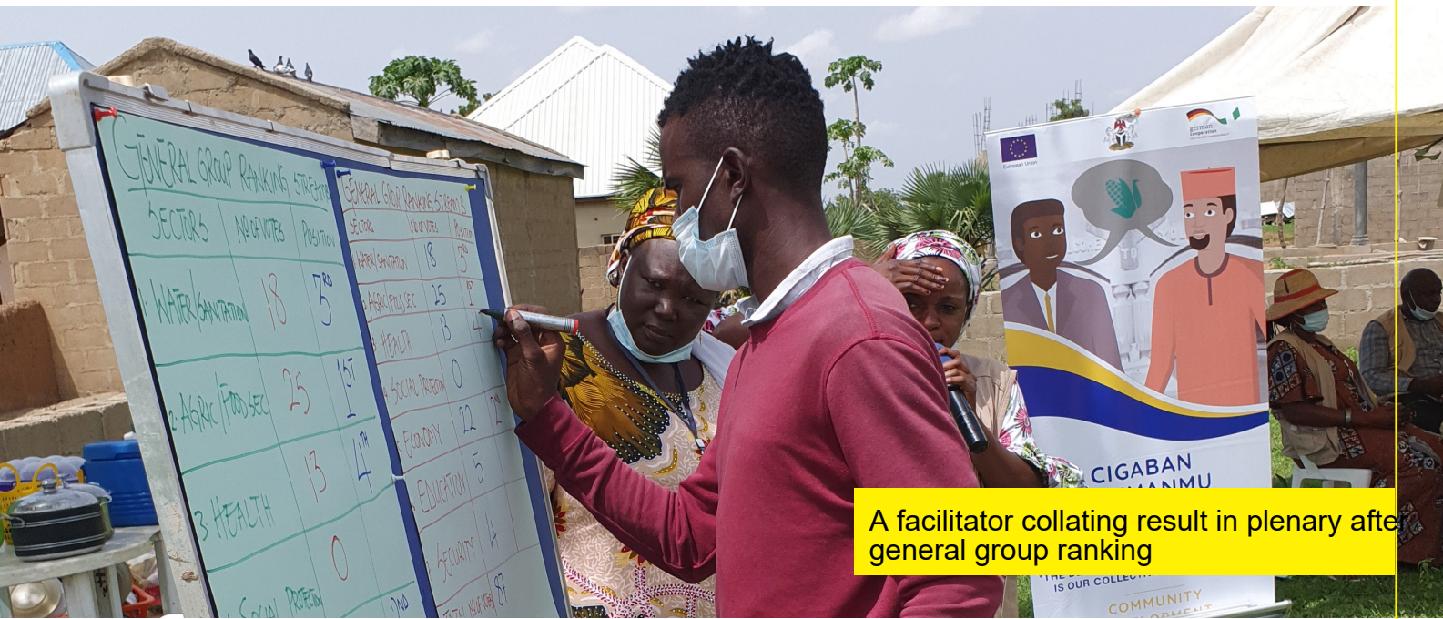
A facilitator collating result in plenary after general group ranking