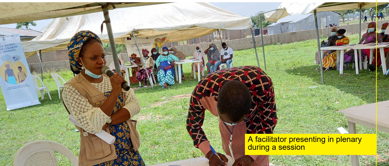
A facilitator presenting in plenary during a session