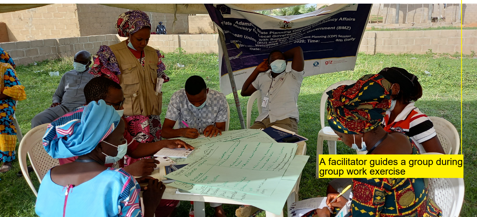
A facilitator guides a group during group work exercise